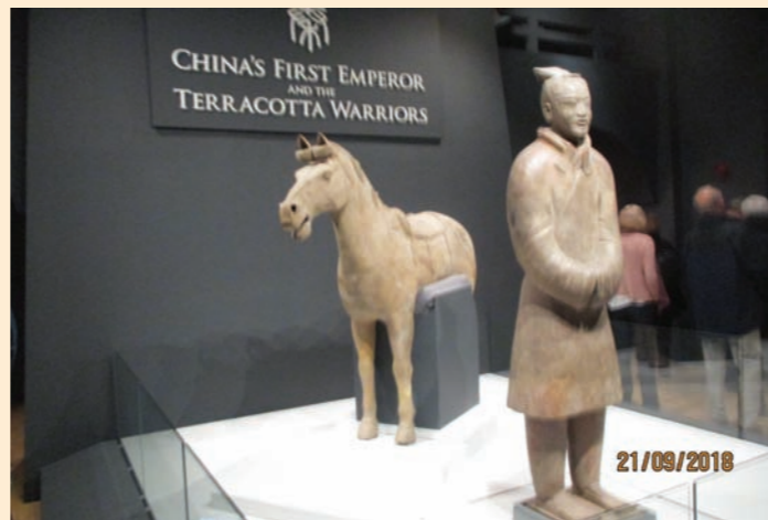
Terra Cotta Soldier