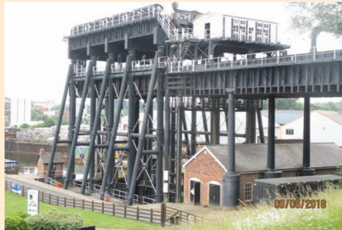
The Anderton Boat Lift