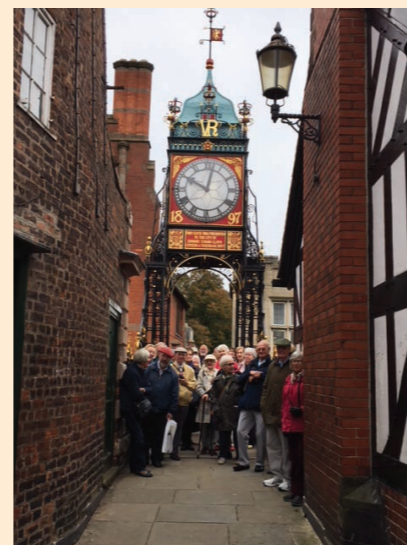
Under the Eastgate Clock in Chester